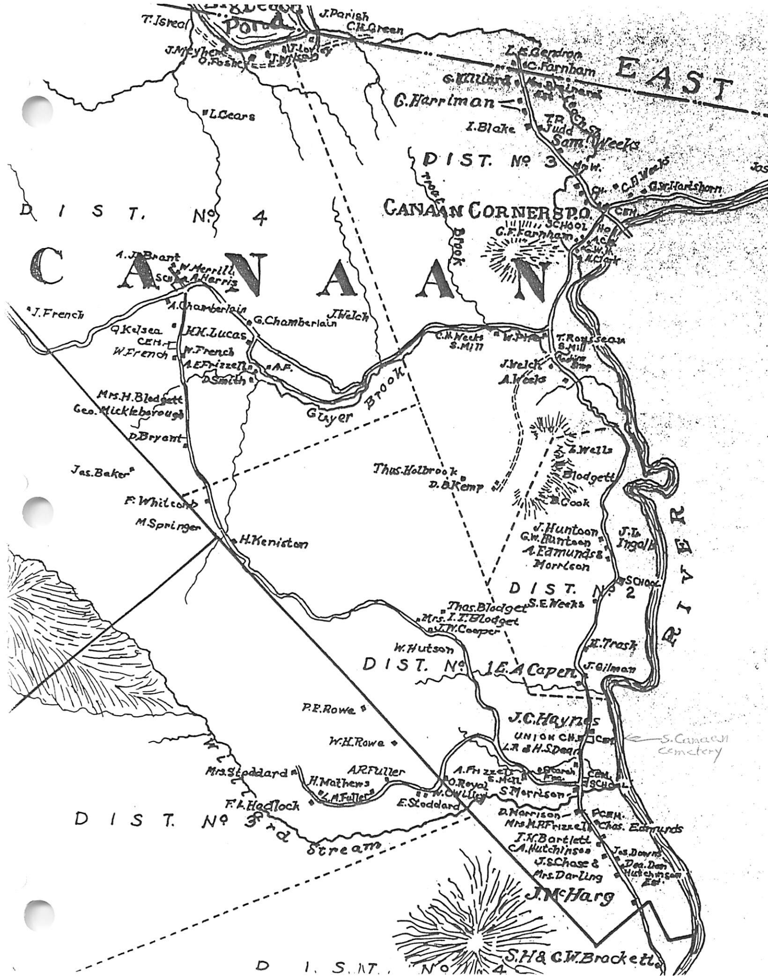
CEMETERIES IN CANAAN - 1876